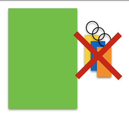
Figure 2 Anyone close to the playing field is not allowed to wear orange, yellow or blue clothes