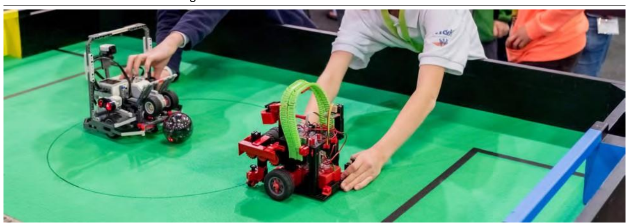
Figure 1 Two teams with one standard kit robot each will compete using an IR ball on RCJ Soccer fields without the out-area. There is no need for using camera vision or line detection.

The aim of this document is to provide an entry-level rule set for RCJ Soccer that is harmonized across countries in Europe and that may be referenced at European local and super-regional tournaments, as well as beyond Europe if needed. However, some sub-regions may have their own version of Soccer Entry rules. Teams are advised to check with their Local Organizing Committee and Regional Representative regarding updates and changes to this rule set specific to their location. Each team is responsible for verifying the correct and latest version of the rules prior to competition.